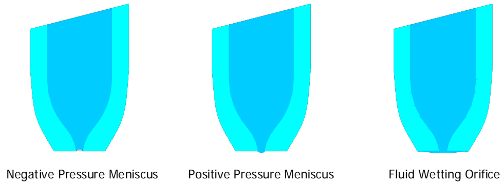
Figure 1 - Meniscus control

Reservoir pressure is important since it directly controls the meniscus location at the orifice. The MicroFab pneumatics control panel allows adjustment of this pressure in both the positive and negative direction. Depending on the fluid under test, the orifice can be seen to either pull the meniscus, and eventually air, into the orifice, or to continuously leak fluid. Proper adjustment is part of the device set-up.